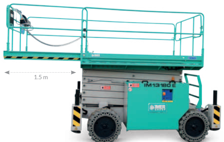
Manual deck extension of 1.5 m for a total length of 4.2 m