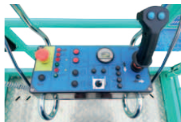
Simple and intuitive control box that can be removed from the basket for loading / unloading the machine