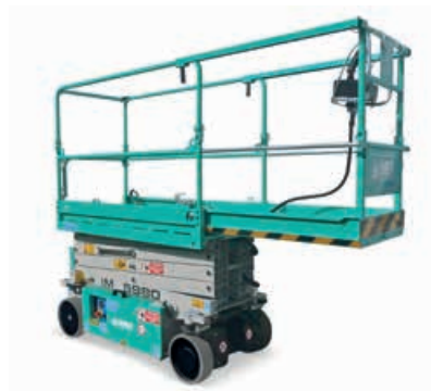
Manual deck extension 1 m