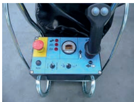
Sturdy, simple and intuitive control box on platform