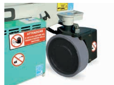
90° wheel steering